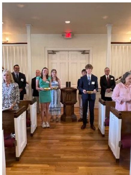
Our Youth Sunday ushers did a wonderful job!