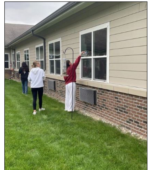
The CHS junior class visited Wellbrook and Whitlock House assembling and placing bird feeders on windows around the facilities for residents.

9th Grade made Appreciation Notes To Service Members, 10th Grade did a AWL Fundraiser, 11th Grade Visited a Nursing Home (Jazz band and bird feeders), and 12th Grade will do a School Grounds Clean-up