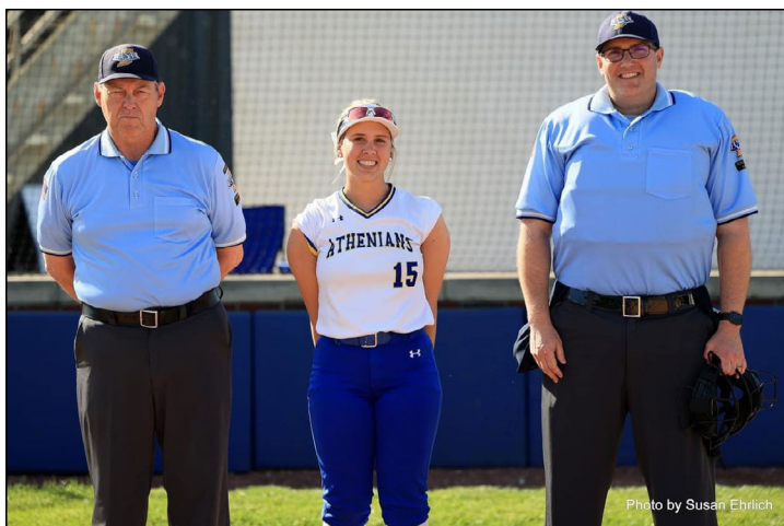
Softball photo by Susan Ehrlich

NFL PLAY 60 app (free and available for iOS and Android devices) users to select an NFL team to compete under and use the Group Quickplay feature in the app's Teacher Dashboard to track a classroom's total activity minutes. To log minutes, participants followed NFL