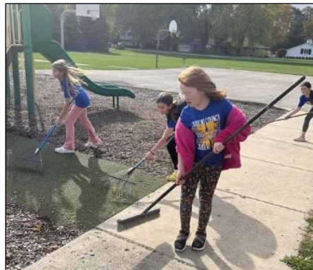
Hoover students tidy up the playground sidewalks as one of their projects.