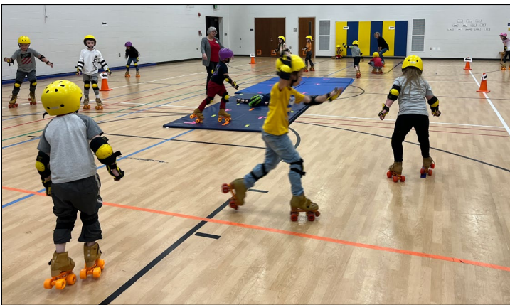
Hose students work on their roller skating skills during P.E.