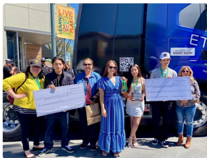
Earth Day Winners - DRCDS & Stein High