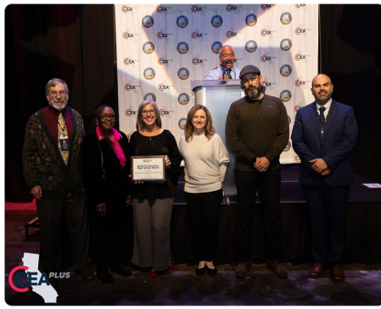
Stein Leadership Team receive Model Continuation High School