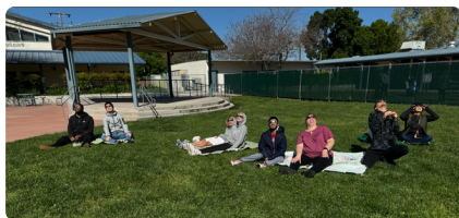
TYAP Enjoying the Eclipse