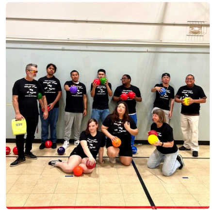
2024 Dodgeball Team