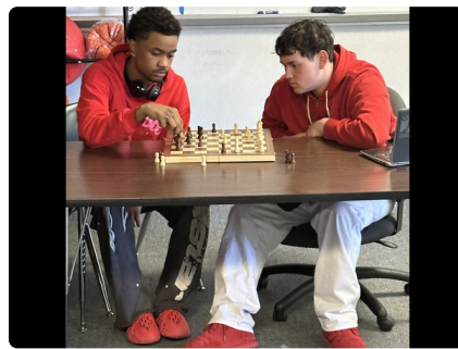
Stein Chess Club