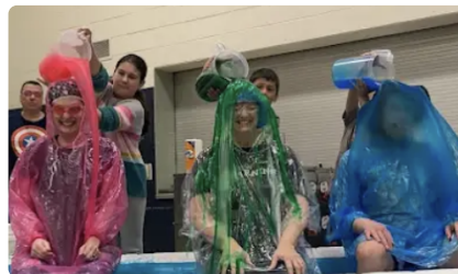
Students Sliming the Teachers