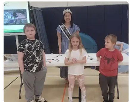
Clinton County Fair Assembly