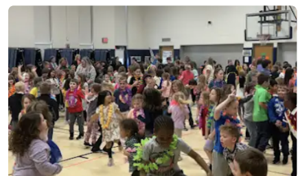
PBIS Monthly Reward: A Hawaiian Dance Party