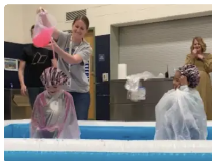
Teachers Sliming the Students