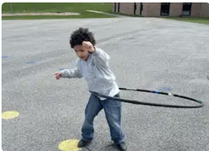
Hoops, Hop Scotch, and Hawaiian Punch with the Principal

We wish you and your families a safe summer filled with memories to cherish!