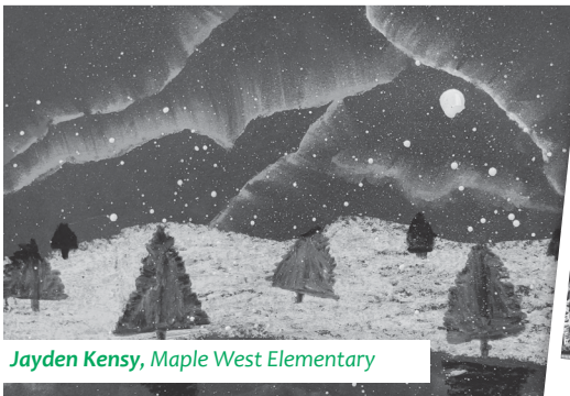
Jayden Kensy, Maple West Elementary