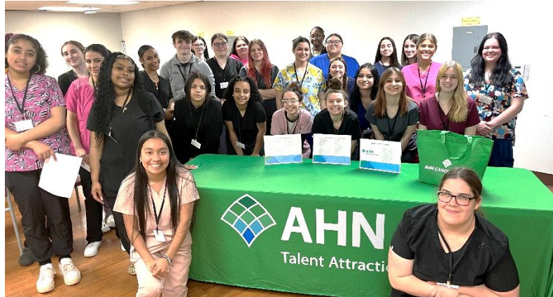
Health Occupations and Rehab Aide students recently toured Canonsburg Hospital's Radiology Department Medical Lab, Respiratory Therapy Center and PT/OT Gym, and spoke with nursing staff about career opportunities within Allegheny Health Network.