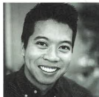
RAY Ray Prop Photography

Ray Prop Photography is pleased to announce that we will be providing graduation portraits for the Class of 2024. Family and graduation pictures will begin at 3:00pm and conclude at 5:00pm, by appointments only. To ensure a smooth graduation portrait experience, we kindly request that families arrive 15 minutes before their scheduled appointment. To schedule an appointment ASAP, call (314) 783-6659. After graduation, you will be sent a direct link to access your photos in our graduation portrait gallery.