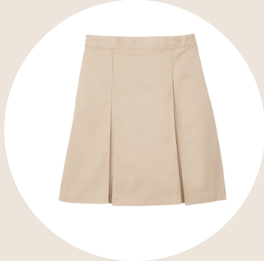
Girls' Skirt (Black and Khaki)