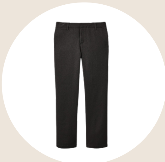
Girls' and Boys' Pants (Black and Khaki)