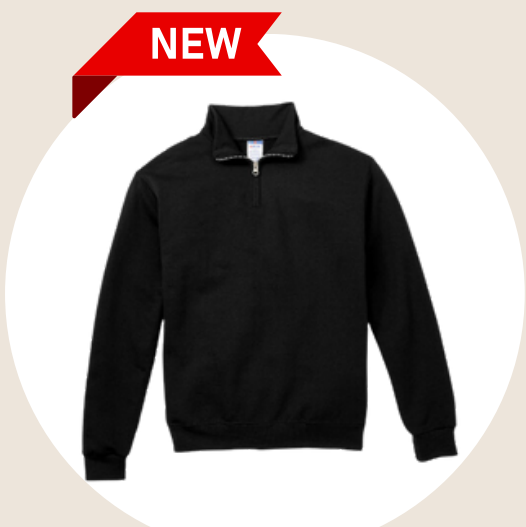
Outerwear Option: 1/4 Zip Sweatshirt (Black)