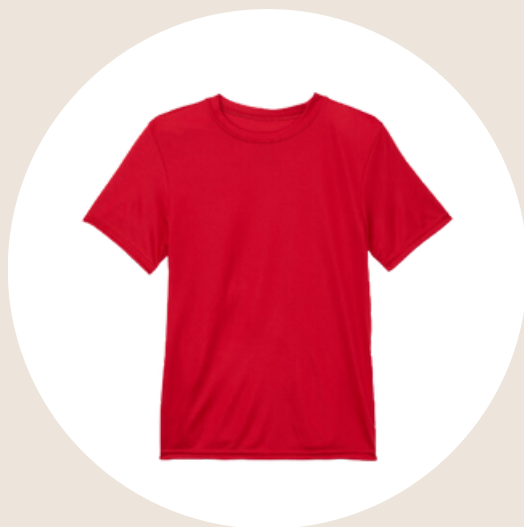
REQUIRED: PE Shirt