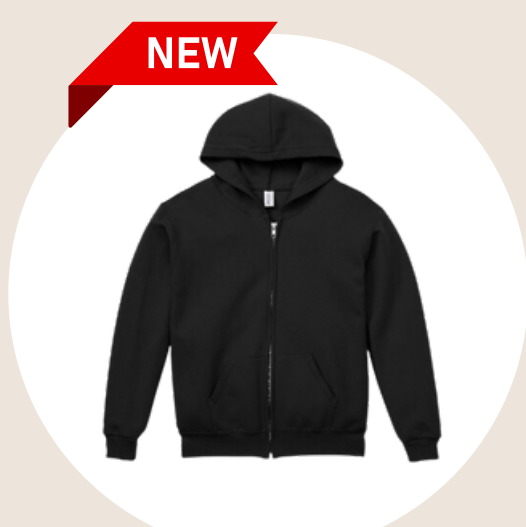
Outerwear Option: Full Zip Hooded Sweatshirt (Black)