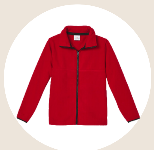
Outerwear Option: Full Zip Fleece Jacket (Red and Black)