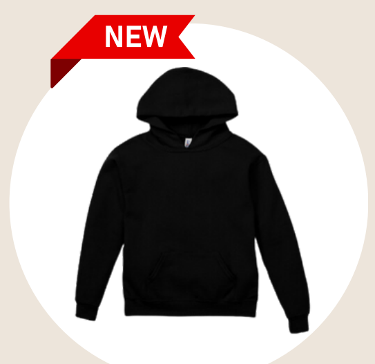
Outerwear Option: Heavyweight and Hooded Sweatshirt (Black)