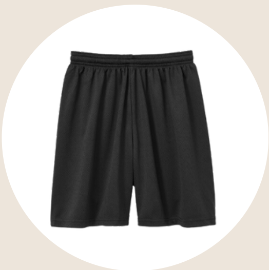
REQUIRED: PE Shorts