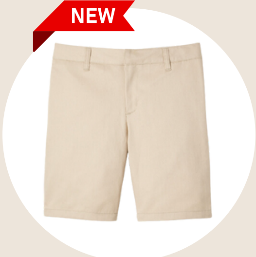
Girls' and Boys' Walking Shorts - Lighter Material (Black and Khaki)