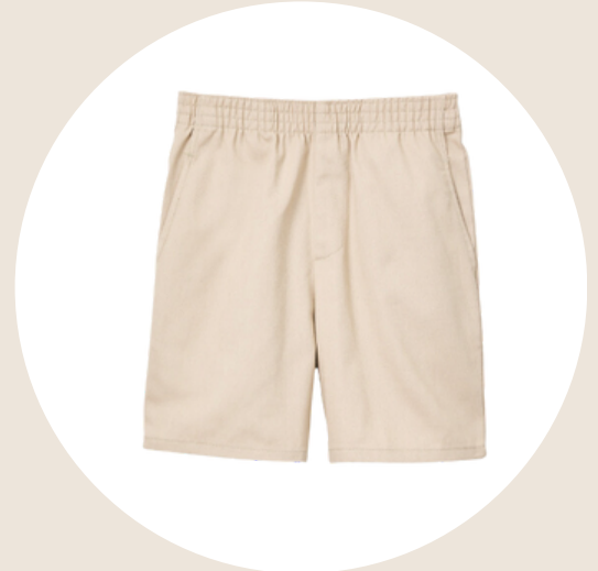
Girls' and Boys' Shorts (Black and Khaki)