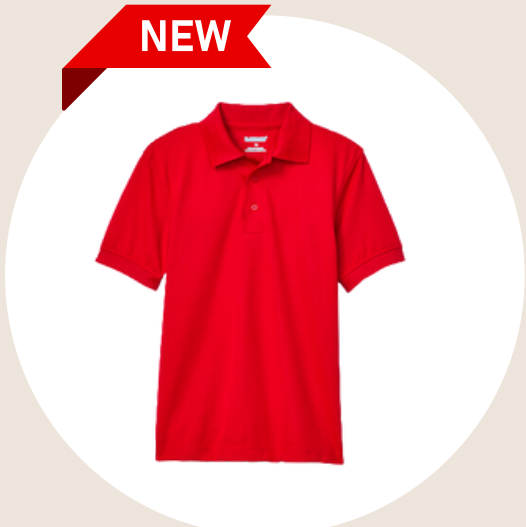
Girls' and Boys' Performance Dri-Fit Short Sleeve Polo (Red and Black)