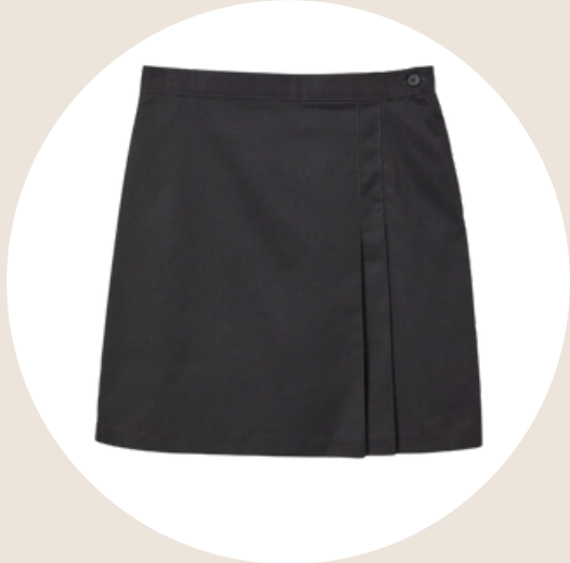
Girls' Skort (Black and Khaki)