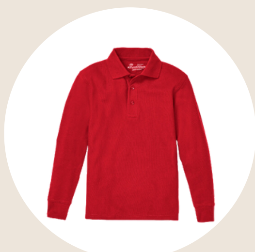
Girls' and Boys' Long Sleeve Polo (Red and Black)