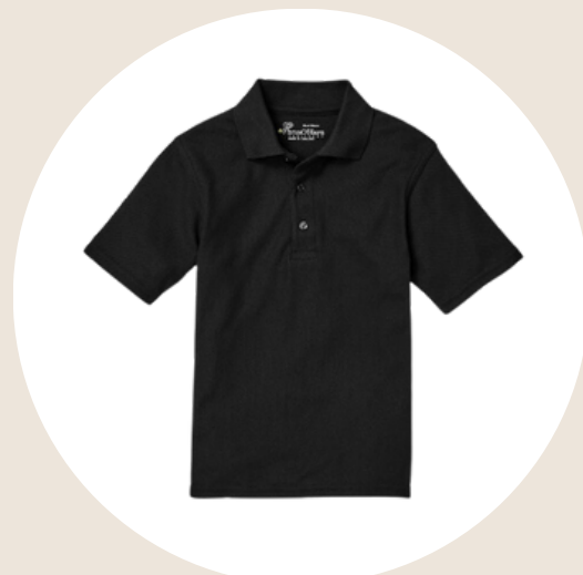
Girls' and Boys' Short Sleeve Polo (Red and Black)