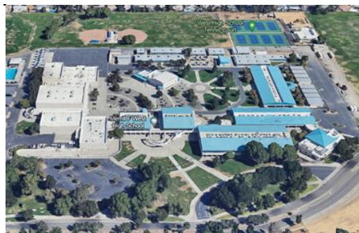
West High School

Do you need to pass your RICA still? If you need to pass your RICA, come join to learn tips and tricks on how to pass as well as strategies to use in your classroom reading instruction! Reading Instruction