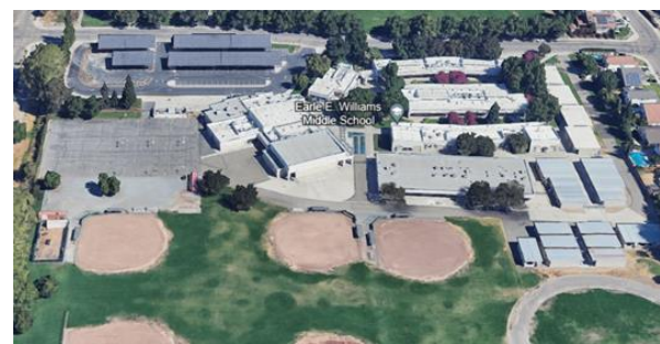
Williams Middle School

The past summer successes included the following; a full refurbishment/remodel of the Villalovoz Elementary School, final installation of the solar at North School, final completion of 60 Electric Vehicle Charging stations, Installation of Modular Bldgs. (12) at various school sites, refurbishment to the school libraries at Jacobson, Freiler, and Kelley, installation of blinds at various school sites, the complete refurbishment of all tennis courts at Tracy, West, and Kimball High Schools, installation of various Hydration Stations installed at all schools district-wide, installation of Energy Management Systems for HVAC systems at Stein, Freiler, and Kellye schools, installing a New HVAC system at Monte Vista Middle School., and refurbishing the pools at both West and Tracy High Schools. Tracy Unified School District received the Environment + Energy Leader Award for Top Project 2024!!