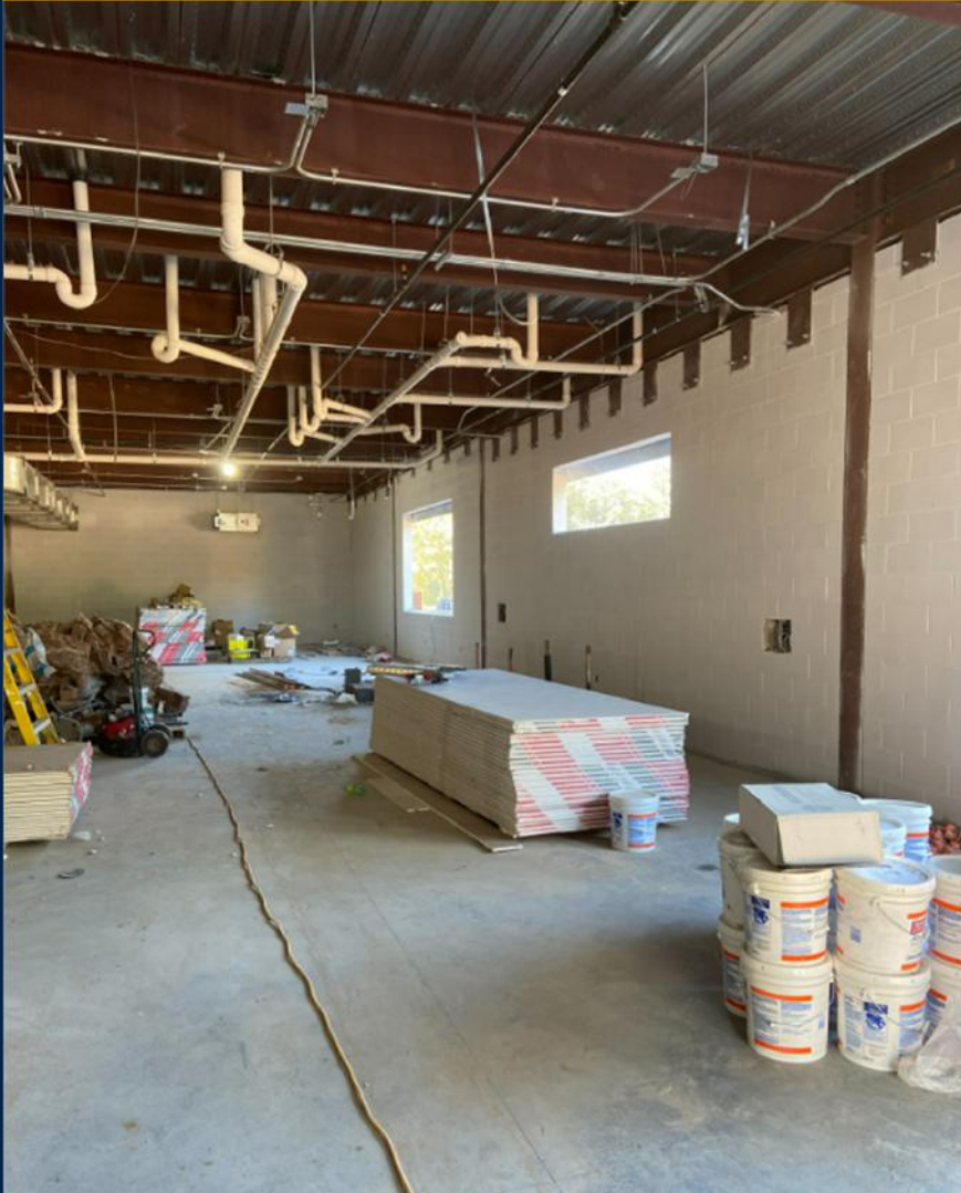
MEP OVERHEAD AND BLOCKFILL IN THE WEIGHT ROOM