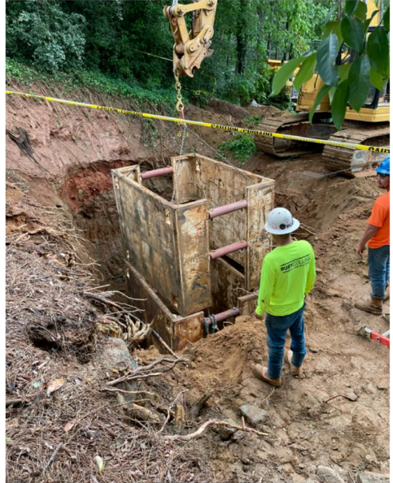
WORKING ON STUCTURE S-2