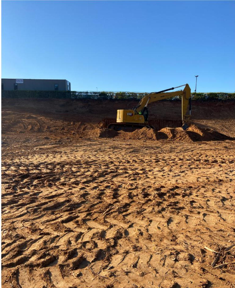
BEGINNING OF HILLSIDE GRADING FOR THE SOUTH RETAINING WALL