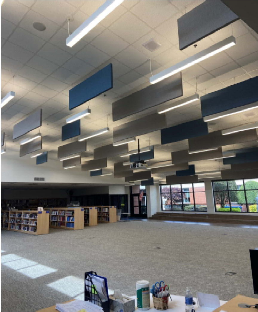
ACOUSTICAL BAFFLES IN THE MEDIA CENTER