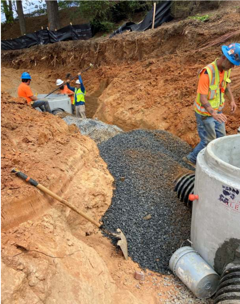
STORM LINE AND STRUCTURES FROM B-3 TO B-4