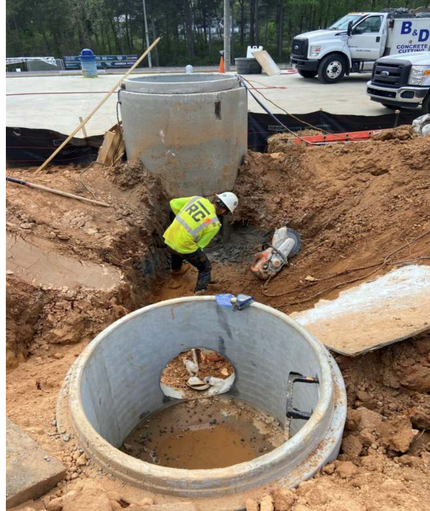
STRUCTURES B-1 AND B-2