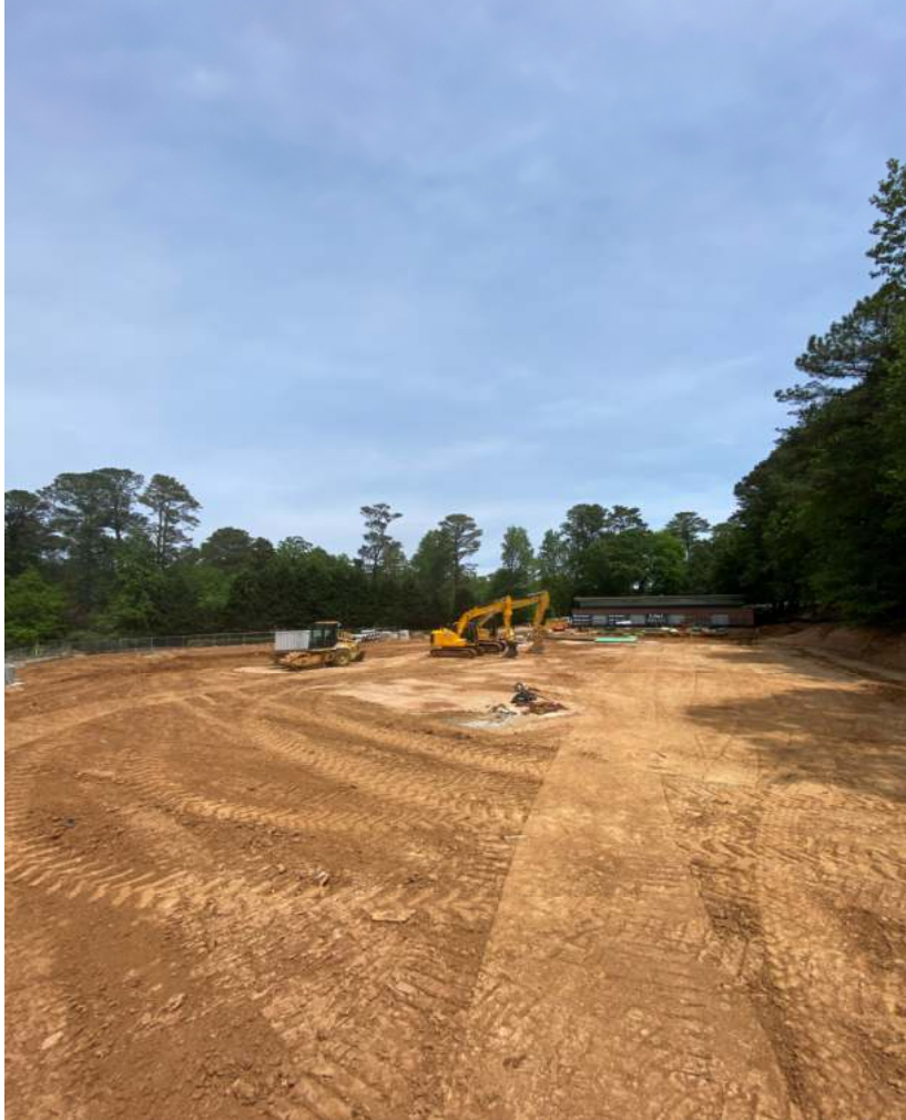
OVERALL SITE PHOTO