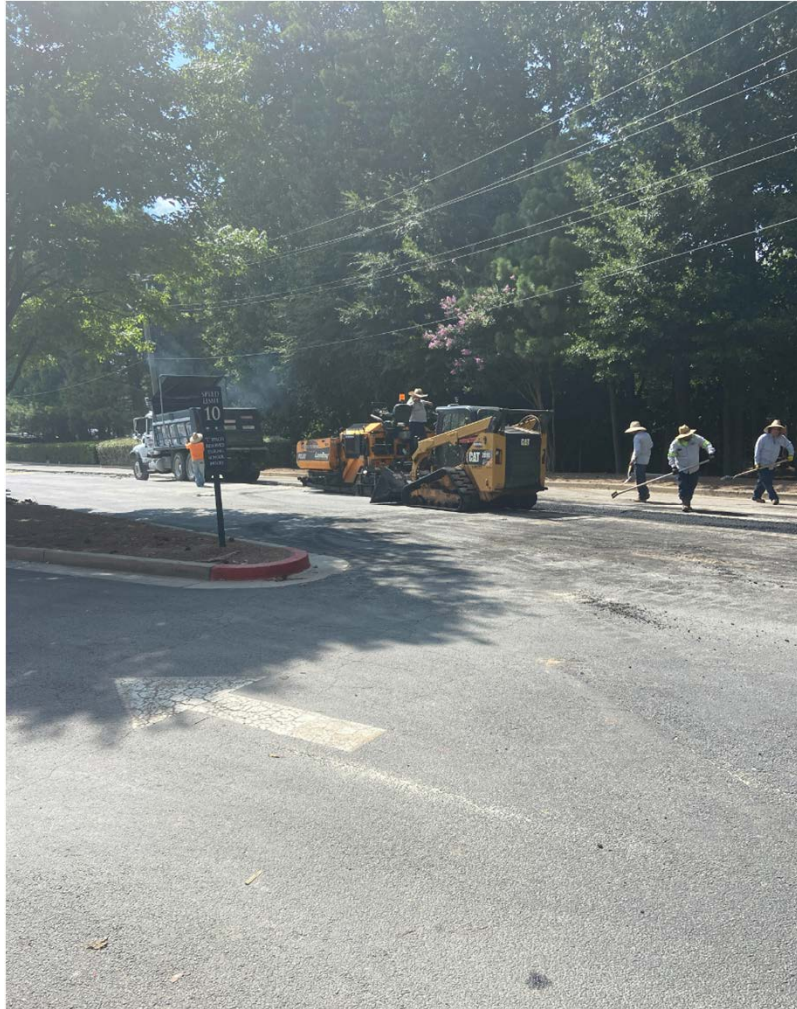
ASPHALT PAVING THROUGH THE PARKING LOT