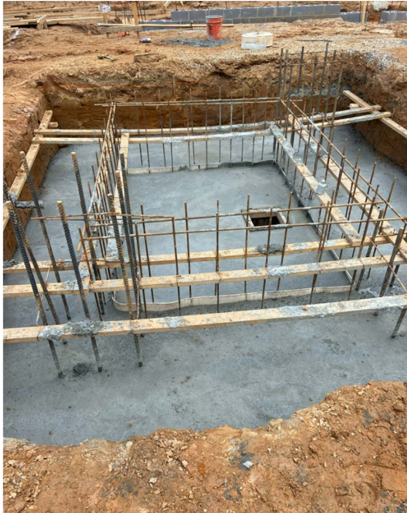
ELEVATOR FOOTING POURED