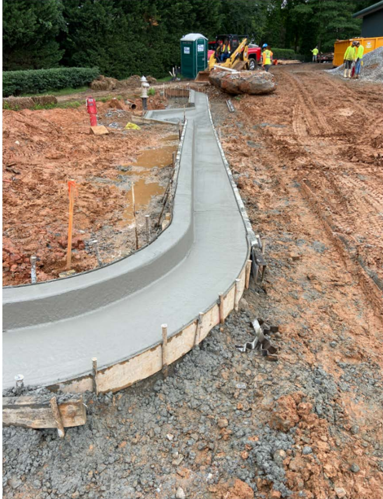
CURB FORMED AND POURED