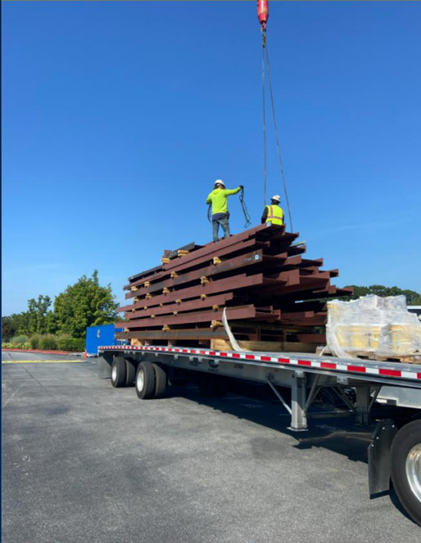
STEEL BEING DELIVERED