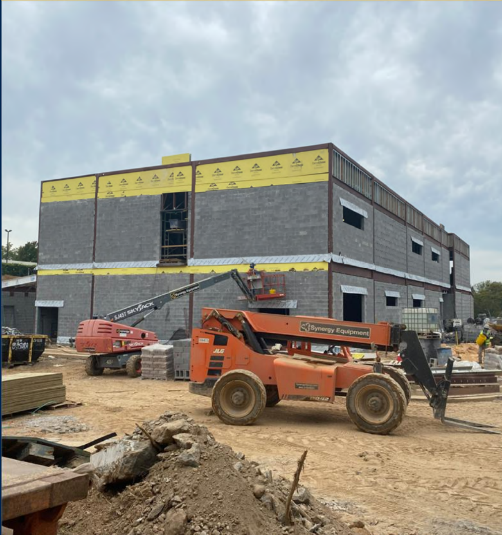
OVERALL BUILDING PHOTO