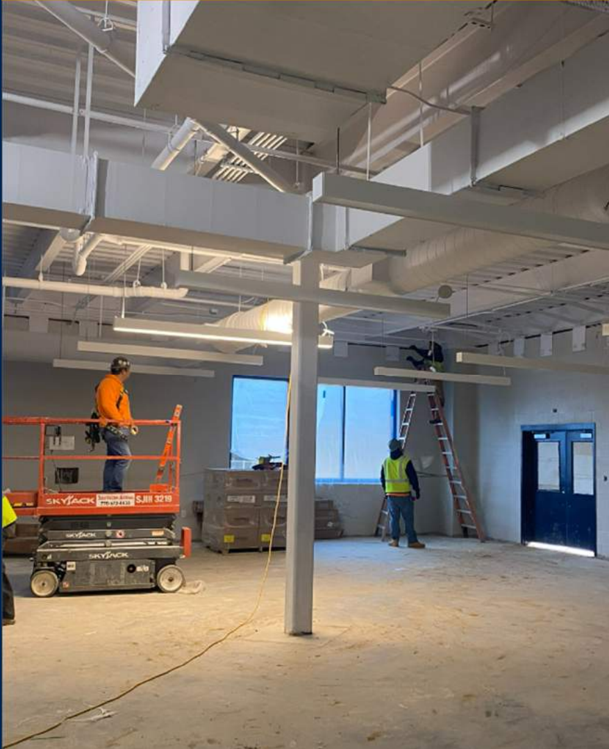
HANGING LIGHTS IN STRENGTH TRAINING ROOM