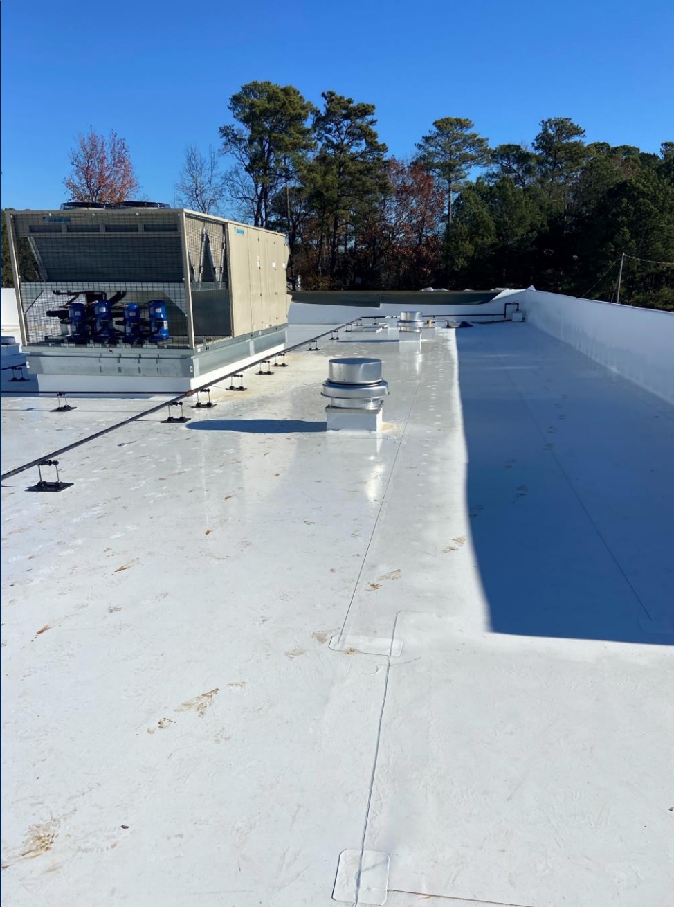
ROOF TOP UNIT SET