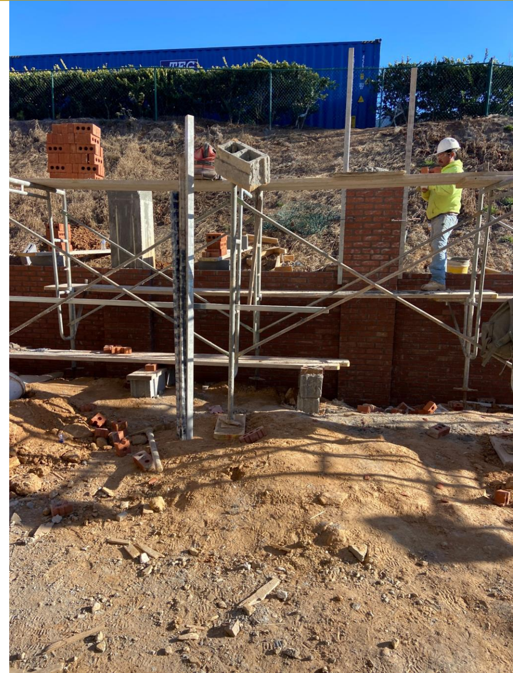
BRICK AT RETAINING WALL