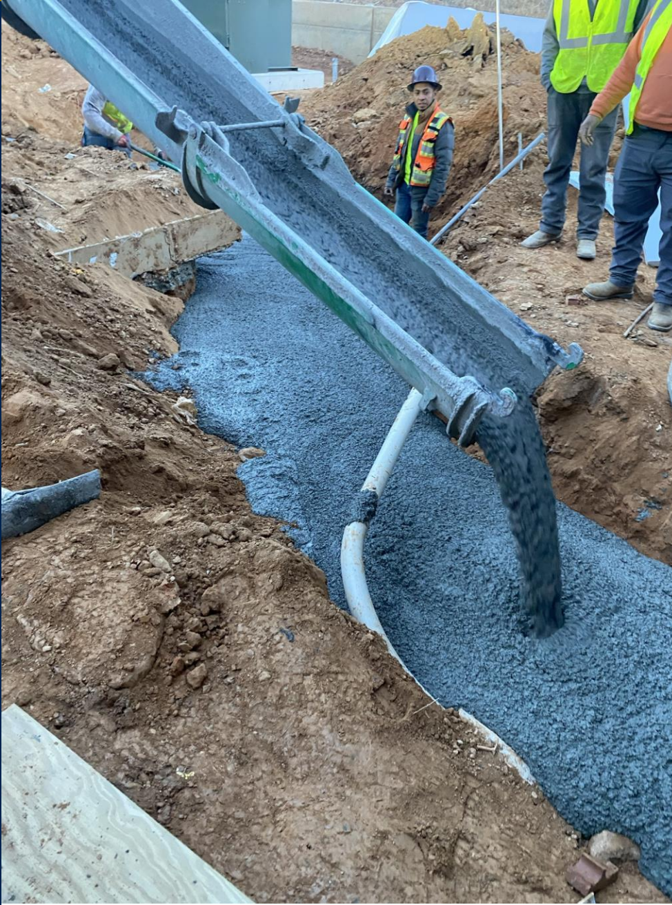
SWITCHBACK RAMP FOOTERS