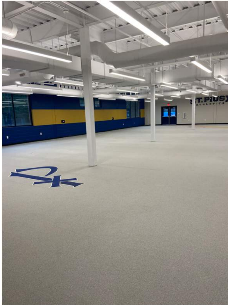
STRENGTH TRAINING ROOM