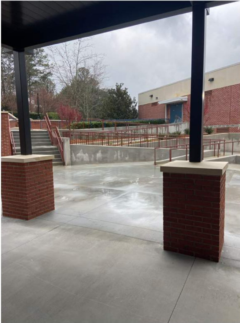
SWITCHBACK RAMPS AND HANDRAILS