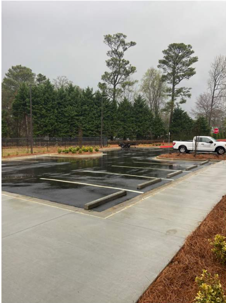
LANDSCAPING AND PARKING LOT