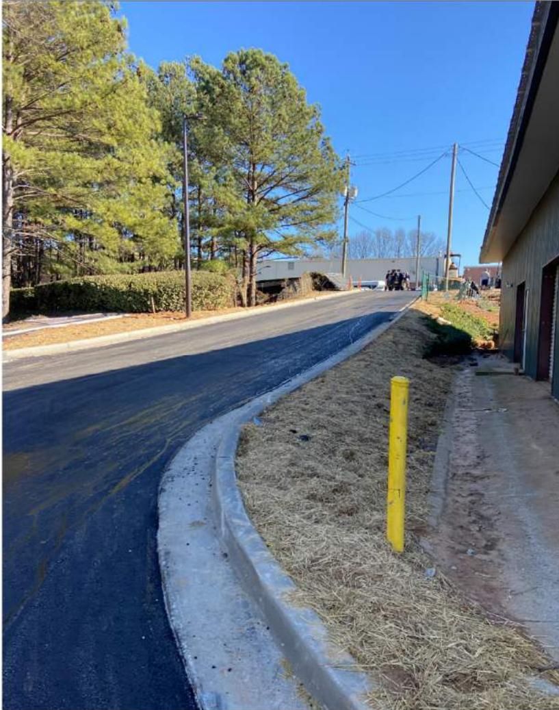
ENTRANCE DRIVE ASPHALT POURED