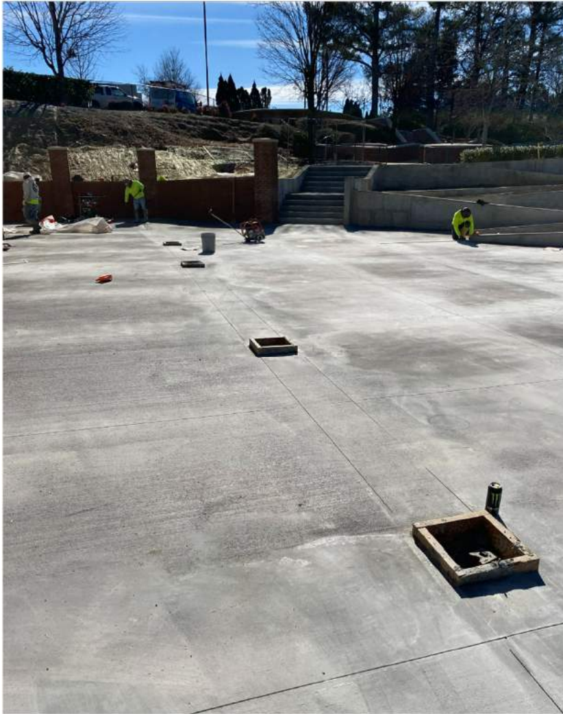
CONCRETE PLAZA POURED