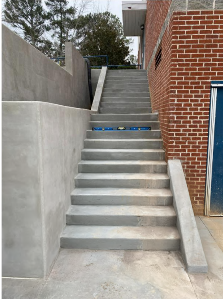
STAIRS BY THE PRESS BOX