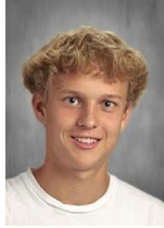
Van Dietrich Physical Education