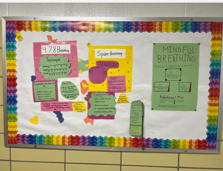
Check out these posters from BRMS Health students all about mindful breathing techniques!