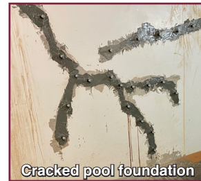
Cracked pool foundation