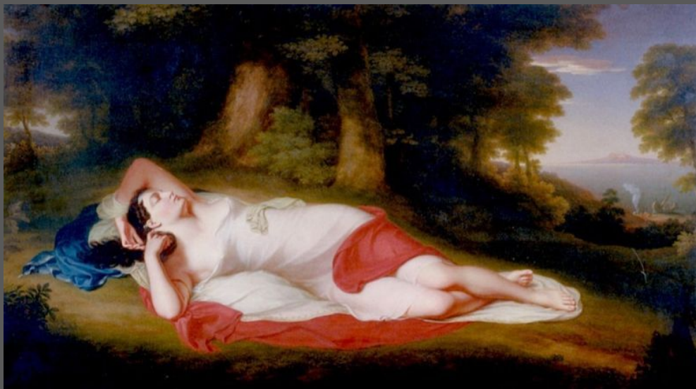
AN ARCHAEOLOGY OF SILENCE ARIADNE ASLEEP IN THE ISLAND OF NAXOS , 2022 BRONZE 11 4/5 x 59 x 29 1/2 INCHES