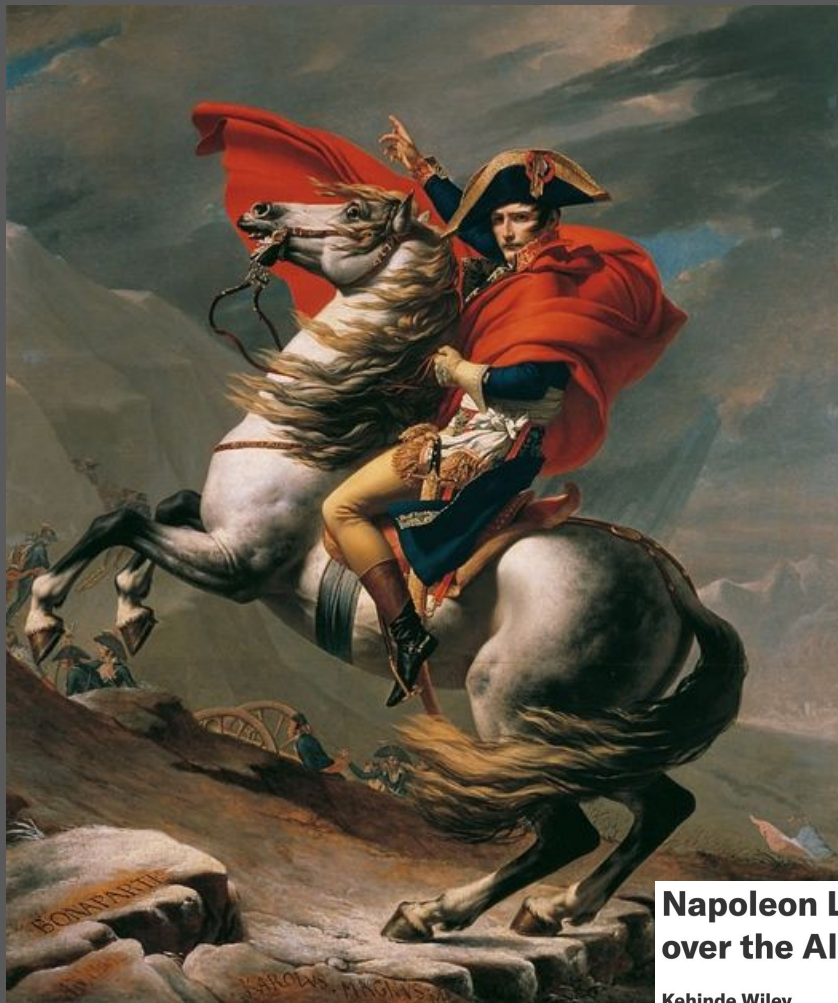
Napoleon Leading the Army over the Alps