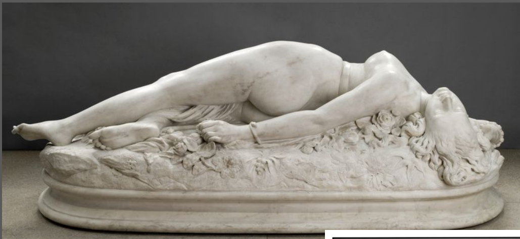
AN ARCHAEOLOGY OF SILENCE FEMME PIQUÉE PAR UN SERPENT (MAMADOU GUEYE) , 2022 OIL ON CANVAS 131 7/8 x 300 INCHES