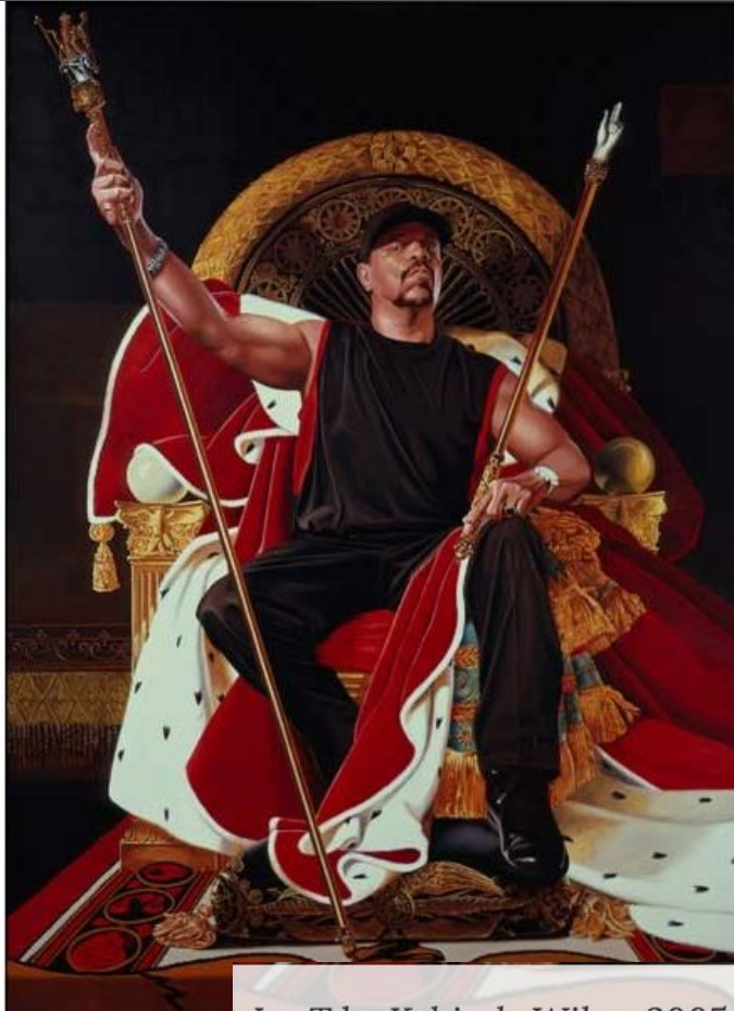
Ice T by Kehinde Wiley, 2005. Oil on canvas.