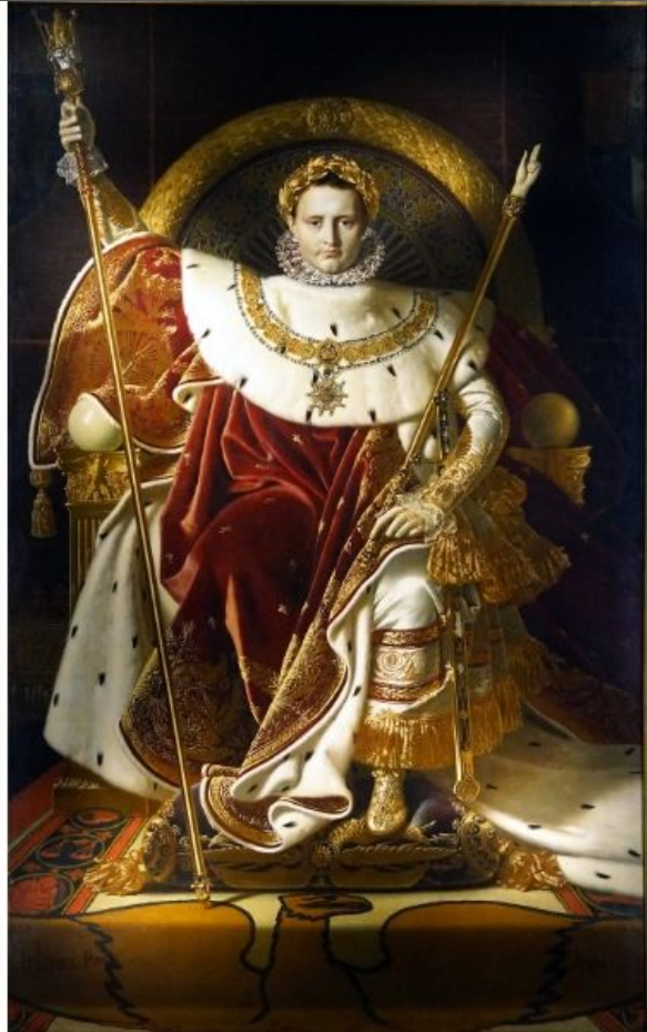
Napoleon on His Imperial Throne, Jean Auguste Dominique Ingres, 1806.