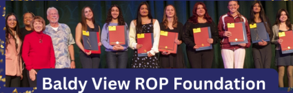
Baldy View ROP Foundation