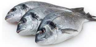
FISH AND SHELLFISH