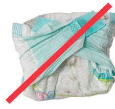
PET WASTE OR DIAPERS