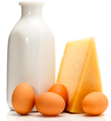
DAIRY PRODUCTS AND EGG SHELLS