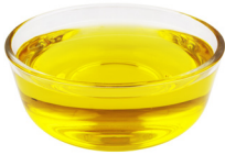
INCIDENTAL OILS AND FATS