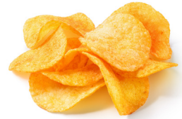
CHIPS AND SNACKS