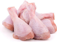
MEAT AND POULTRY