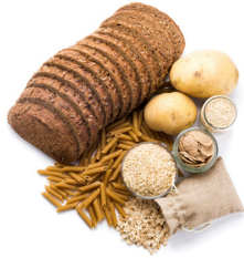
BREAD, GRAINS, RICE AND PASTA