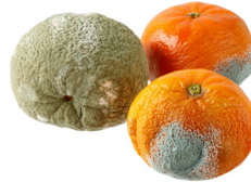
LEFTOVER AND SPOILED FOOD