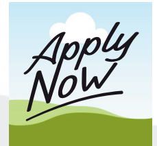
Zone #1 Vacancy See Below