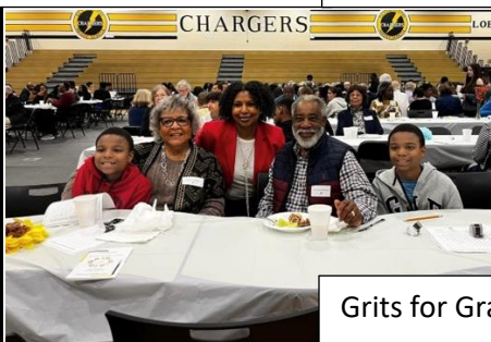
Grits for Grands, April 2024