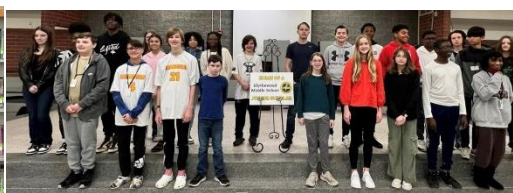
BMS Celebrated 27 Junior Scholars for the 2023-2024 School Year!