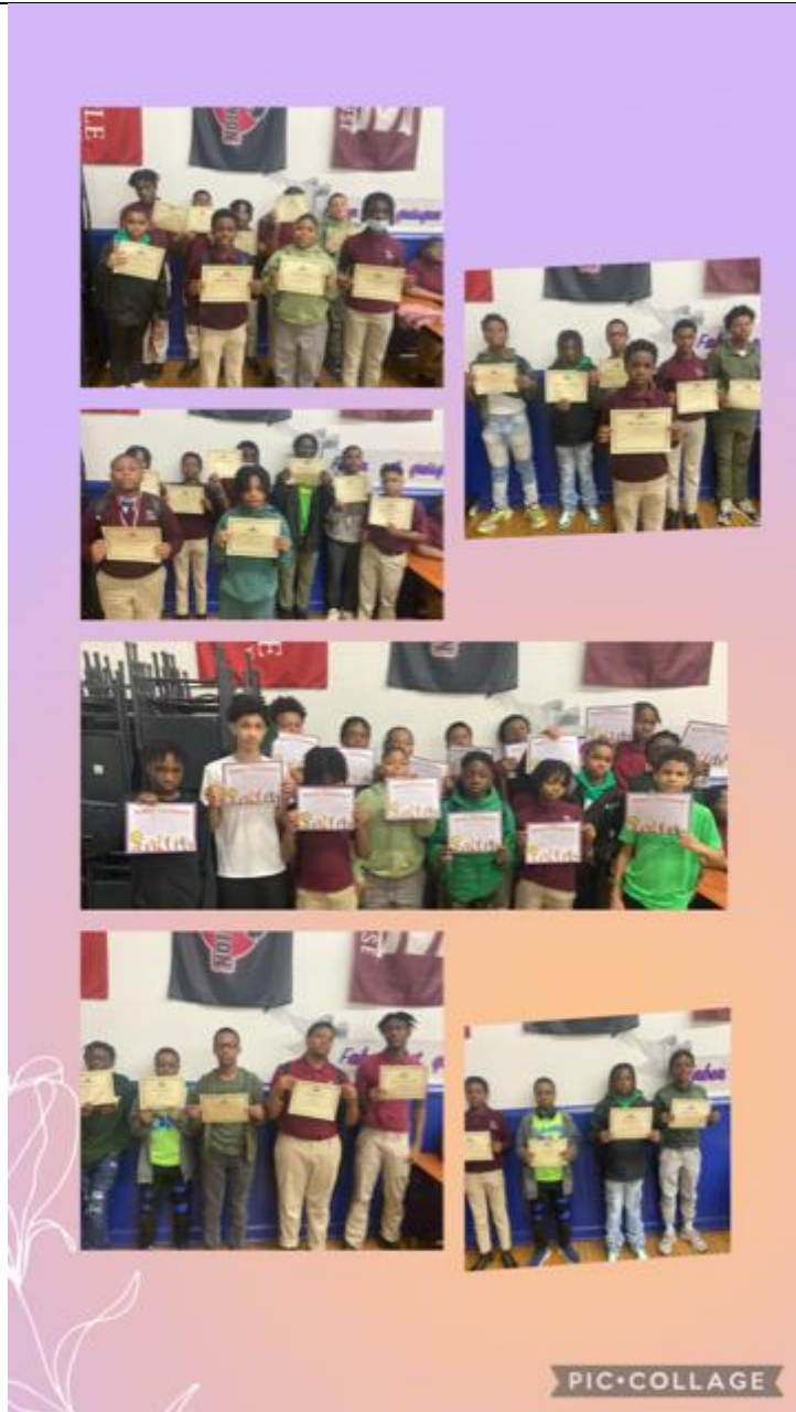
8 th Grade Students