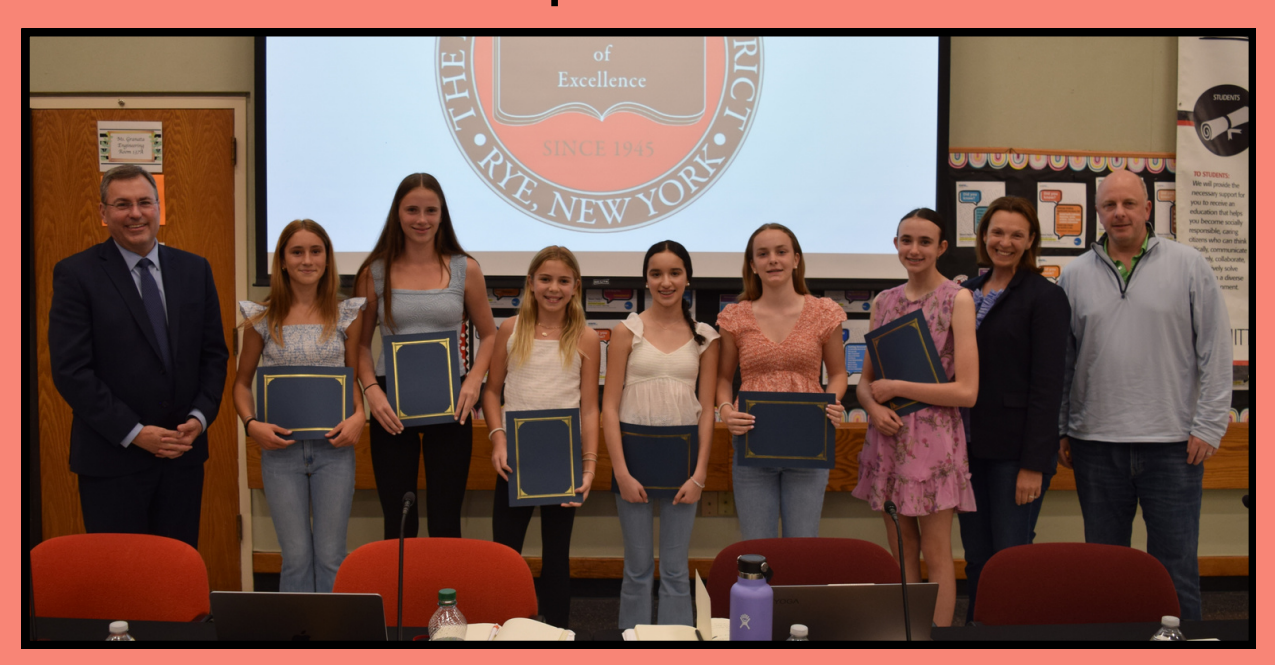
The RMS girls squash team received Rye Recognition of Excellence awards at the April 9 Board of Education meeting for winning the National Tournament