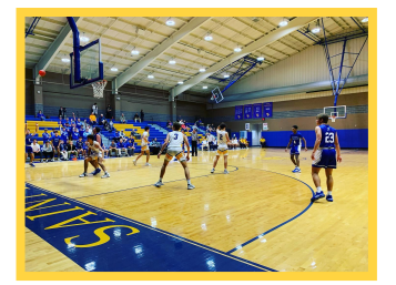
June 3-7: Basketball