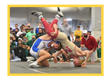
July 15-19 - Wrestling