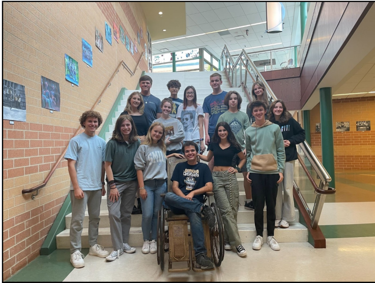
(part of) the cast pictured, all pictures by Andie Bowser