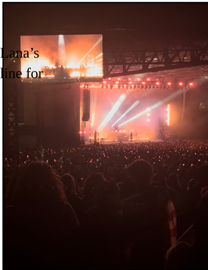
Lana's line for

After eagerly waiting outside of The Pavilion At Starlake outdoor venue, it was finally time to see my favorite artist perform live. It has been five years since her last concert, "LA To The Moon," which was a tour based on her album "Lust For Life." Walking into the venue, you feel a rush of excitement, as this is a once in a lifetime experience. This may have been my only time seeing Lana Del Rey live and I deeply admire her music.