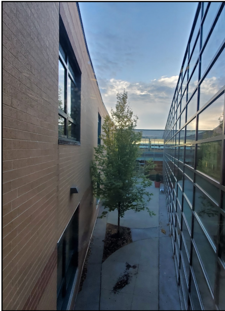
Upstairs view of the PRHS courtyard photos of rooftop garden a courtyard

“Lying at the center of a school, Forgotten, Dull, and Lifeless. It could become a hidden jewel If someone would show it kindness.