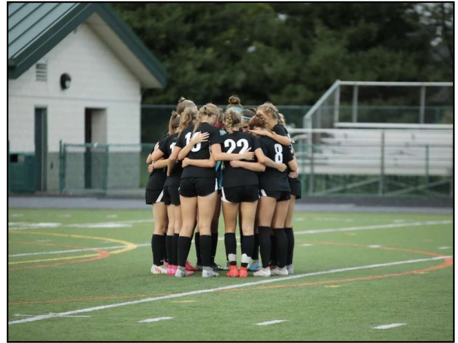
Varsity Girls Soccer Team huddle before game

It’s important for Pine-Richland students of all ages to come out and support both boys and girls sport teams for how much effort they put into this game. When seeing fellow students in the stands, players' confidence can be boosted and allow them to play a better game knowing their friends are there to support them. Good luck to the girls soccer team the rest of this season.