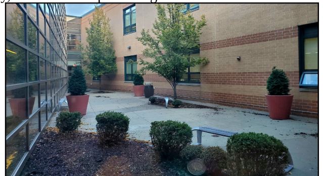
The PRHS courtyard (downstairs view)