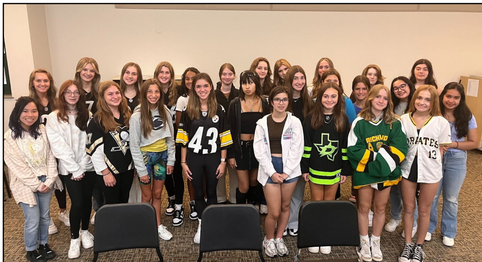
Freshman Choir Pictured

In freshman choir we learn to sing in four part splits, Alto 1, Alto 2, Soprano 1, and Soprano 2. Singing in four parts is difficult because each part has different notes that form a perfect harmony so it teaches us to be more independent and confident when singing since each part has less people. We also work on maturing our voices, so that we sound more like high school students rather than little kids.