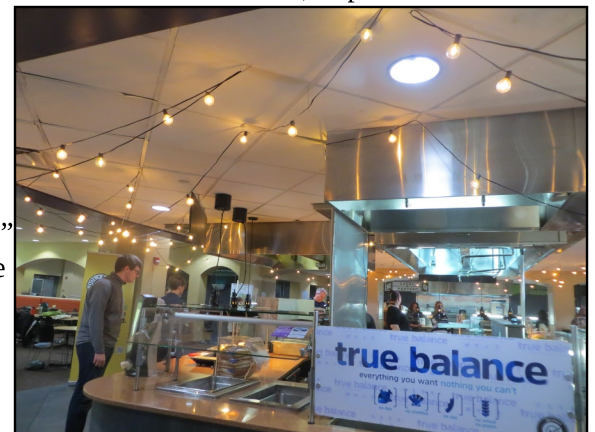
Slippery Rock Cafeteria