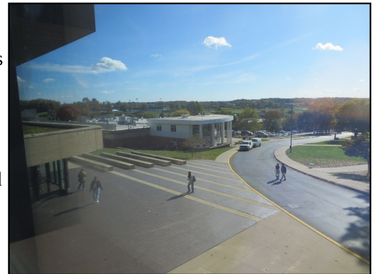
View of the Slippery Rock Campus from a window, photo by Maddy Homer

A brief tour was offered to all the participants in order to familiarize them with the most central areas of the building. Bowen and Biagini agree that the campus was “very beautiful” and “aesthetically pleasing.” It was also “very rock-themed and walkable,” they added in a joking yet honest manner. The campus was small and had an emphasis on nature with its abundance of trees in its rural setting. Dorigo claimed that the site was “very cozy.” She and Jithesh felt that finding their way around the campus was easy and hassle-free. In addition, Dorigo enjoyed the on-site Starbucks and thought that the Slippery Rock staff were extremely welcoming.