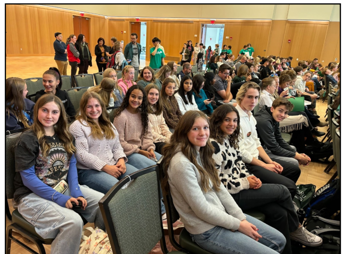
All participating students at the award ceremony