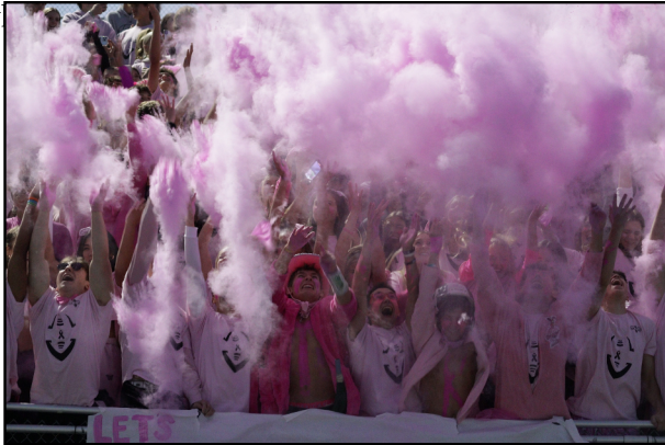
PR student section during the game

On October 13, PR celebrated Senior Night before the football game against Shaler Area. However, the bigger story was