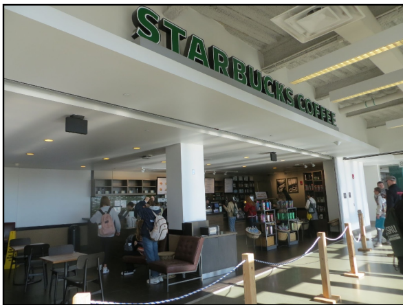
On-site Starbucks

Here is where the four student's opinions differed the most. Bowen stated that the university had a very nice dining hall with lots of tasty options.