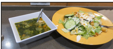
Food served in the cafeteria, photo by Maddy Homer

Overall, the food was ok and quite usual, but the students enjoyed the various options offered to them.