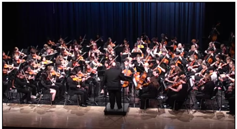
View of the entire orchestra