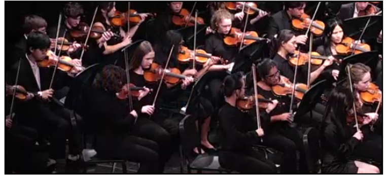
View of the violins at the concert