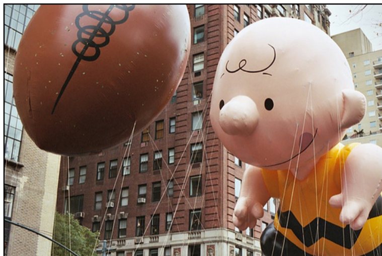
The first Charlie Brown Balloon

Make sure to check out the Macy's Thanksgiving Day Parade this Thanksgiving (November 23rd) on NBC. The stream starts at 9 AM.