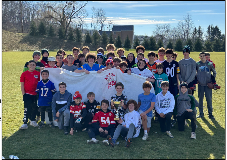
2022 Turkey Bowl participants

Grandma's fresh chocolate chip cookies, mom's homemade chocolate covered pretzels, multiple different pies, pumpkin roll, Uncle Mark's homemade whipped cream, and fresh cups of coffee. While enjoying our sweets, Aunt Cheri pulls out conversation cards. These cards range from thought provoking questions to "would you rather" questions to completely unrealistic conversation starters. They may seem stupid, but the amount of tangents, unpredictable conversations, and enormous smiles that result in these cards are priceless. Before we know it, the sun has set and hours have passed. We express our gratitude and love for one another before heading home.