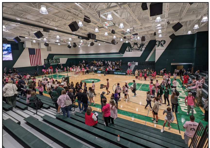
View of the gym after the volleyball game