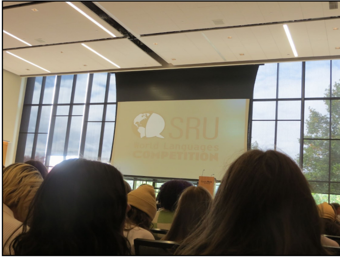
View of the award Ceremony