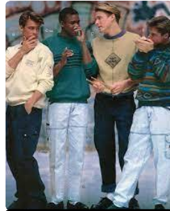
1980s Boys Fashion

In the 1980's women started to tease and crimp their hair to give it that big "poof." This was also when baggy jeans and denim jackets came into style, along with lots of "workout wear." Boys continued to let their hair grow out and be free, causing the mullet to be quite a hit.