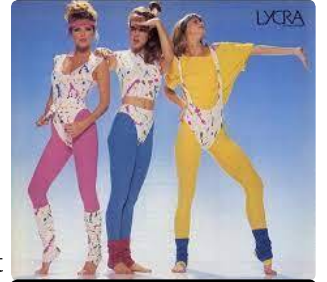
1980s Girls Fashion

They also got on the denim bandwagon but they also loved the leather jackets.