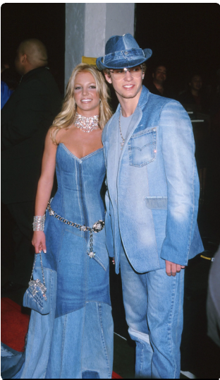
L-R: Britney Spears and Justin Timberlake at a 2001 awards show

The second half of this decade was when Spears signed her first deal with Jive Records, at 15. The record label molded and coached her into the mega pop star she is now. Britney’s audition for the record label actually was seen to be awful, there were actually many executives who thought her audition was awful.