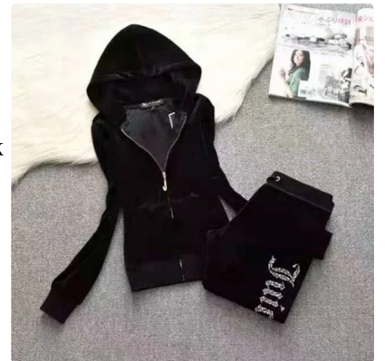
Juicy Couture Tracksuit

The 2000's was when major crop tops sprung up and were seen on every girl, along with low-waisted jeans. Tracksuits were also a big hit with the girls, especially from the brand "juicy couture." Boys started to love the "saggy jeans" look paired with a white tank top. They also brought back buzz cuts and introduced beanies.