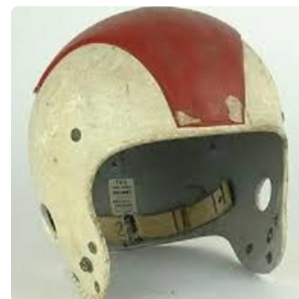
1930s Leather Helmets