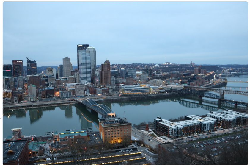
Downtown Pittsburgh.