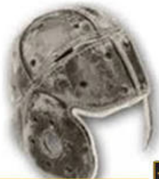
1893: THE FIRST HELMET

Have you watched a recent football game and just wondered how much the football helmet has evolved? Well, today I'm going to write about the different football helmets throughout the decades and see how much they truly changed.