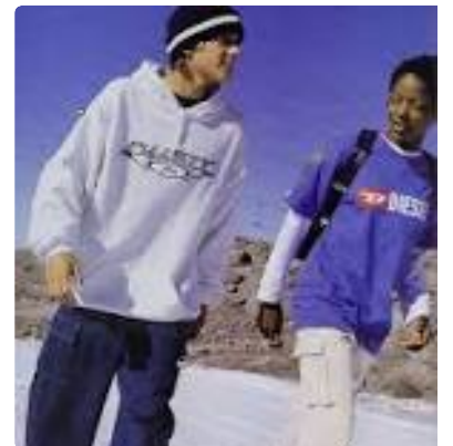
2000s Boys Fashion