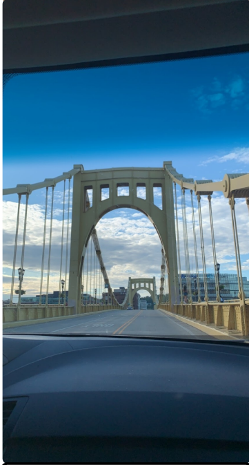
Downtown Pittsburgh.