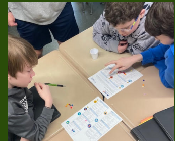
Fifth Grade working on their author houses!