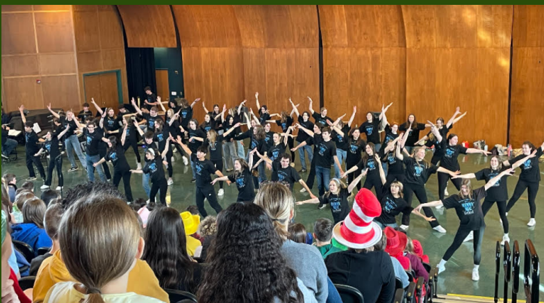
Preview of the PRHS musical, "Mama Mia!"