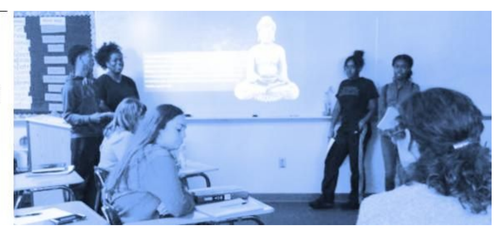
Students present and lead a discussion on Buddhism during their IB Warld Religions class. The IB Diploma Program invites students to stretch out of their comfort zones and investigate similarities and differences among cultures and ways of knowing, like imagination, memory, and faith.

http://www.ibo.org/university-admission/recognition-of-the-ib-diploma-by-countries-and-universities/