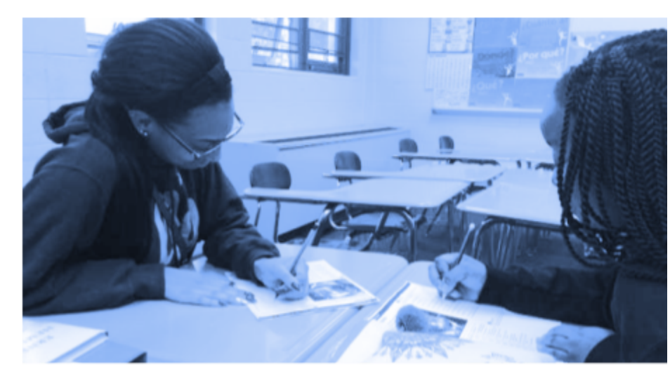
Two students collaborate in their IB Spanish ab initio class. The IB focuses on cross-cultural connections and requires all students working toward the full IB Diploma to take another language.

Most students who take IB classes at John Adams come in through the IB magnet. There is an application process that begins in November of the student's 8th grade year. The deadline for application is December 15. Acceptance letters are mailed in January.