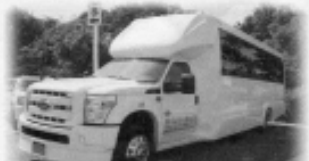
32 /36 /48 Passenger Shuttle Buses