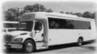
32 /34 /36 Passenger Limo Buses

Weddings - Shuttle Transportation - Airport Transportation Bachelor /ette Parties - Sweet 16 / Quinceaneras - Night On The Town Vineyard Tours - Sporting Events - Bar/Bat Mitzvahs - Holiday Tours Concerts - Theatres - Cruises