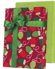
Christmas Bulbs Reversible