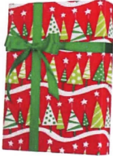
Christmas Tree Rock