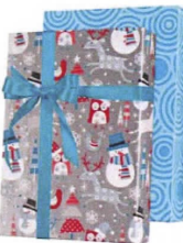
Snow Play Reversible