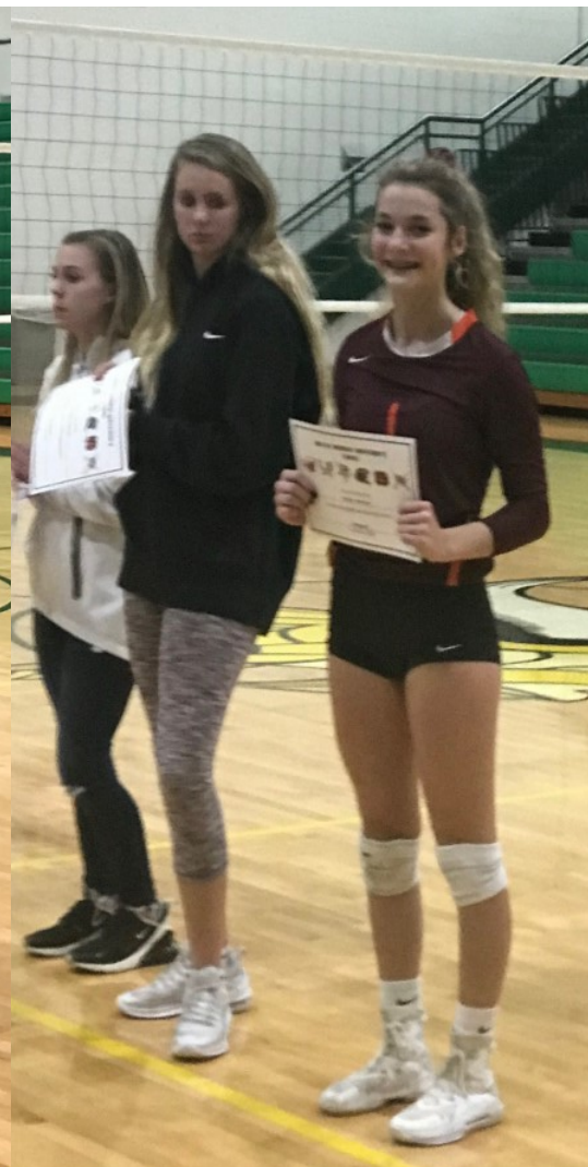
2019 Terrier Volleyball team

The 2019 Terrier Volleyball team has had a GREAT SEASON. Entering into the post season the girls sat at a record of 15-7 and they are the 2019 Blue Ridge District Runner-Up.