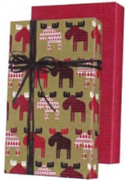
Material Moose Reversible