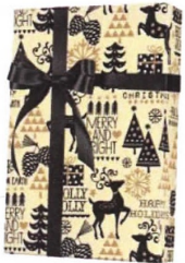
Merry & Bright