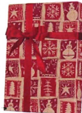
Homespun Christmas Kraft