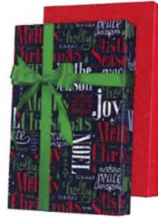
Tis The Season Reversible