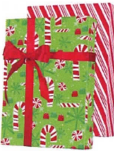
Contempo Canes Reversible