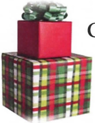
Christmas Weave Reversible