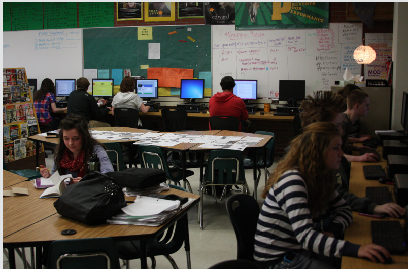
The CMR journalism students work on newspaper and yearbook in the colorful, busy atmosphere in room 326.

Students in all classes learn writing skills, design techniques, organization and time management, advertising sales and design, editing skills, teamwork and communication.