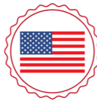
Citizenship Seal (Ohio)