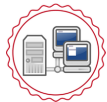
Technology Seal (Ohio)