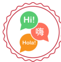
Biliteracy Seal (Ohio)