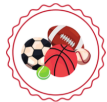
Student Engagement Seal (Local)