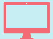
Computer (fully charged)