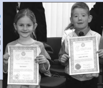
(right) THANKSGIVING ESSAY CONTEST (1st Place) and (3rd Place)