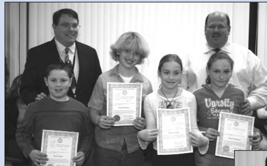
(above) BASKETBALL SHARPSHOOTERS Winners