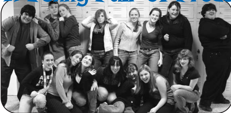
The Sayville Players as (left) a Shakespearean troupe and (right, below) The Odd Couple .