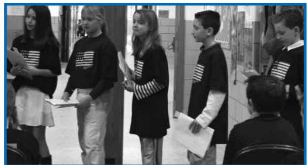
Sunrise Drive Essay Winners