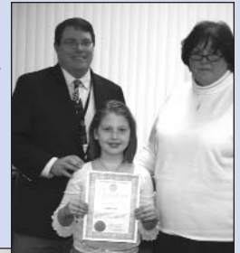
(right) LOCKS OF LOVE Student donated 12 inches of hair to make wigs for financially disadvantaged children with long-term medical hair loss.