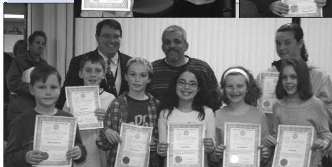
(left) QUIZ BOWL WINNERS