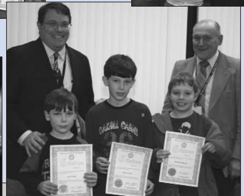
(above) WINNERS IN THE LONG ISLAND CHESS NUTS SCHOLASTIC TOURNAMENT (1st Place), (8th Place), (Medal winner)