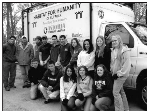
Sayville High School's Habitat volunteers