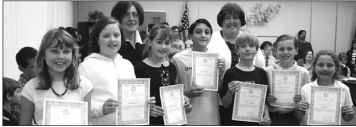
(left) Sunrise Drive QUIZ BOWL TEAM Wins First Place in SUFFOLK COUNTY COMPETITION