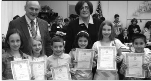
(right) SUNRISE DRIVE REFLECTIONS WINNERS FOR PHOTOGRAPHY, LITERATURE, AND VISUAL ARTS: