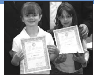
(above, l-r) LINCOLN AVENUE REFLECTIONS WINNERS: (Music) Award of Excellence: and Award of Merit: