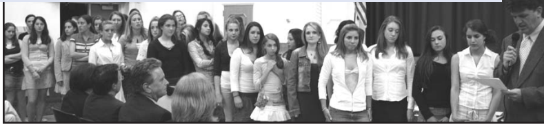
Members of the undefeated Girls Track & Field Team and Suffolk County Champions