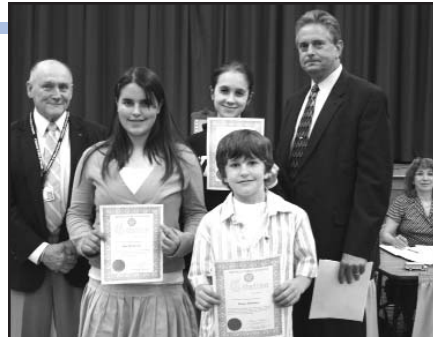
(left) HISTORY LEAGUE SUFFOLK COUNTY CHAMPIONS