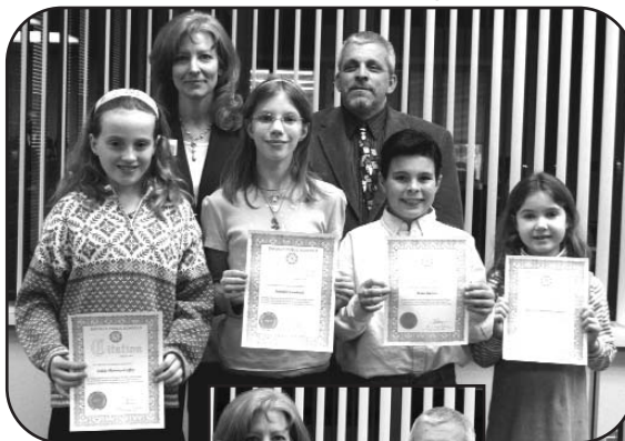
(left) RANDOM ACTS OF KINDNESS WRITING CONTEST WINNERS