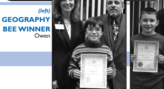
(left) GEOGRAPHY BEE WINNER