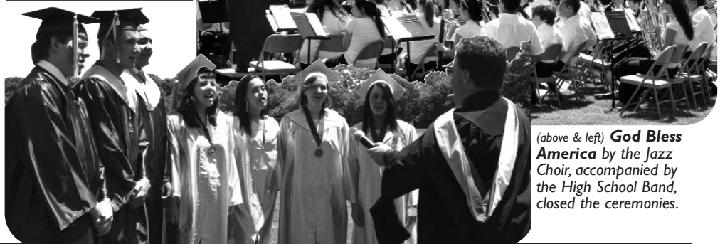
(above & left) God Bless America by the Jazz Choir, accompanied by the High School Band, closed the ceremonies.