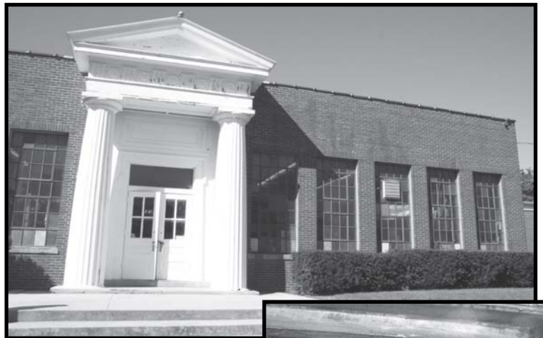
Photos of Tyler Avenue Maintenance Facility. Because Tyler Avenue is not an instructional facility, it is not eligible for State Aid. It would cost the District over 1.5 million unaidable dollars to restore the building.